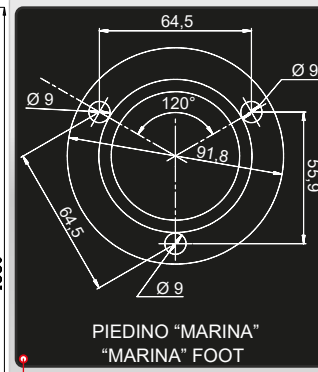
PIEDINO "MARINA" "MARINA" FOOT